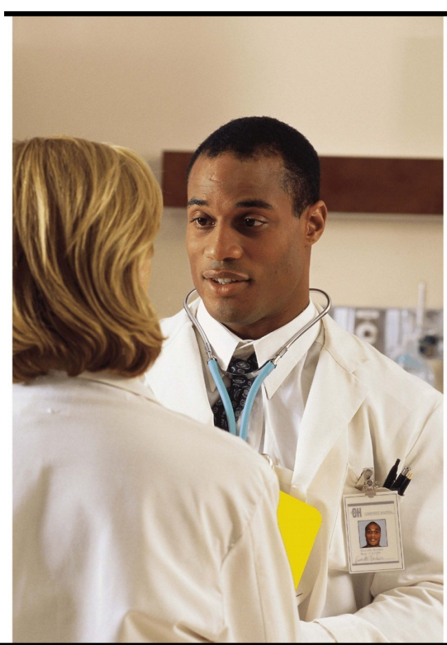
A Guide to Maryland Law on Health Care Decisions (Forms Included)

STATE OF MARYLAND OFFICE OF THE ATTORNEY GENERAL